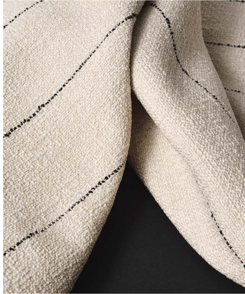
Doris pinstripe fabric.