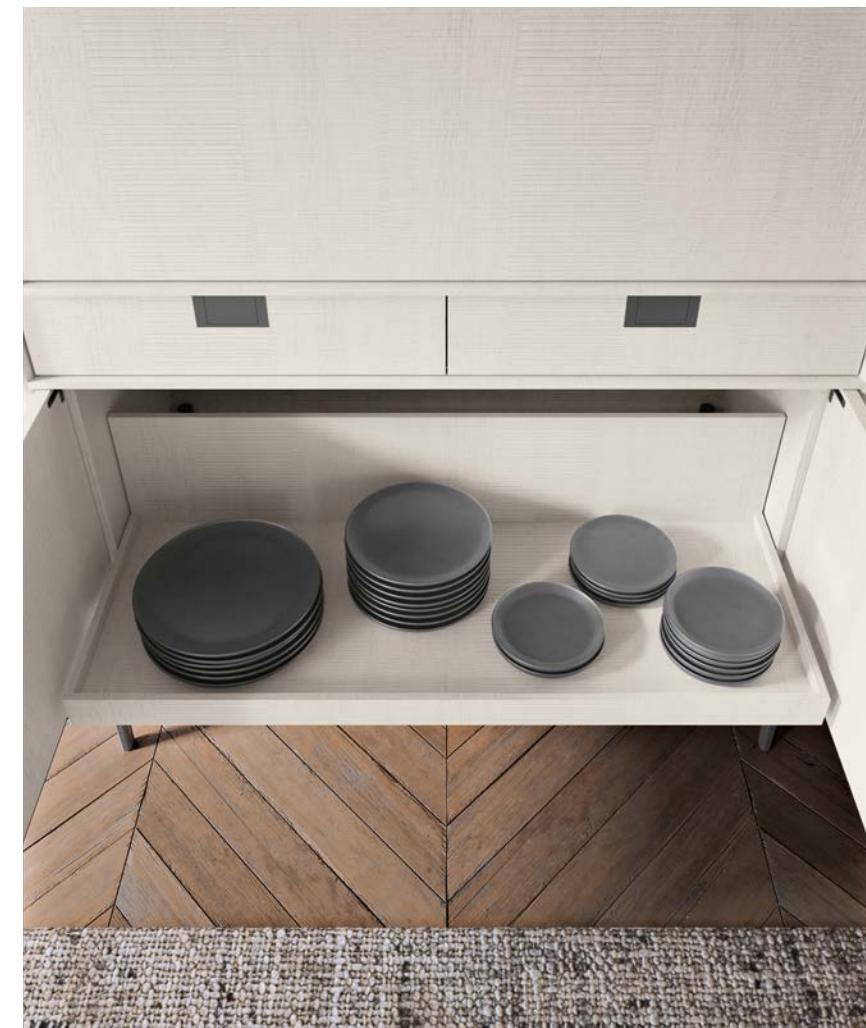
Artemone storage unit, white rough cut oak.