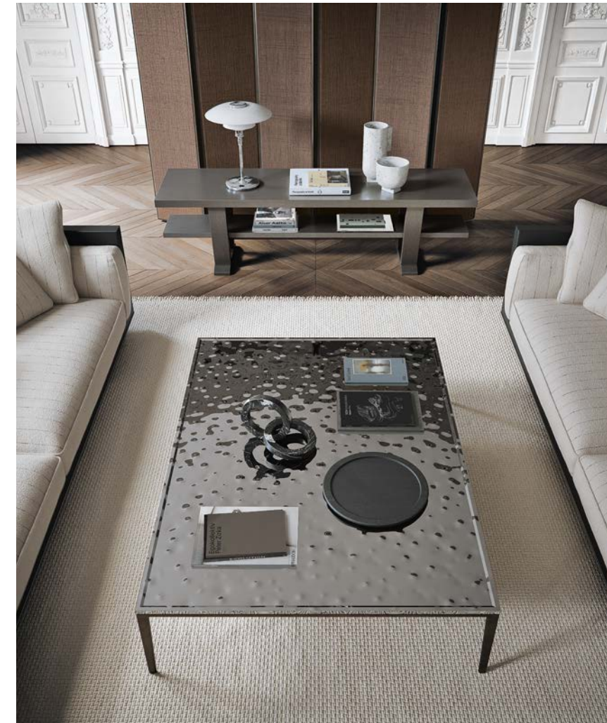
Soleide small table, pewter colour reflective "hammered" steel. Intoto console, brushed black oak. Florius sofas, Doris pinstripe fabric, shellac type finish black. Privatus windscreen, dark colour rafia.