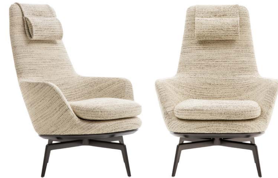
Caratos swivel armchairs, Diana and Serra fabric.