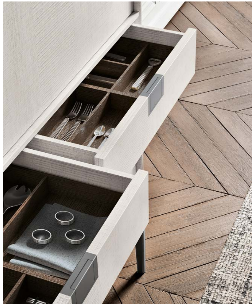
Artemone storage unit, white rough cut oak. Cutlery holder, bronze nickel painted beech.