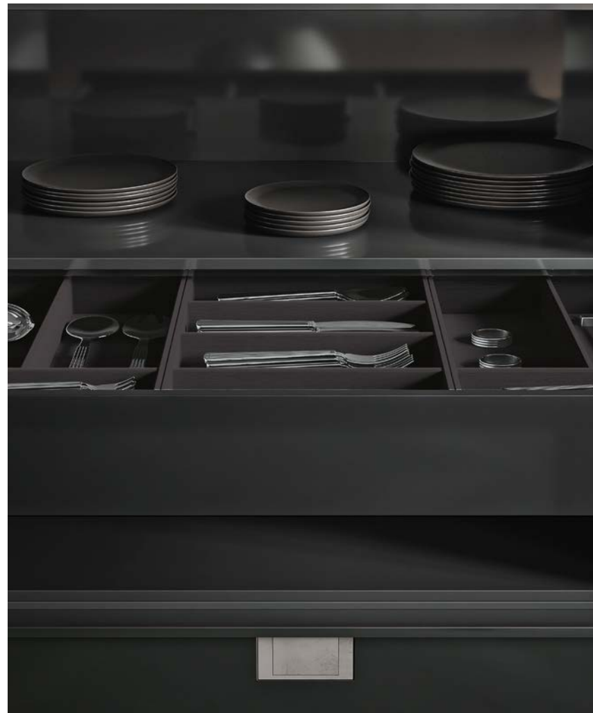
Artemone storage unit, shellac type finish black. Cutlery holder, bronze nickel painted beech.