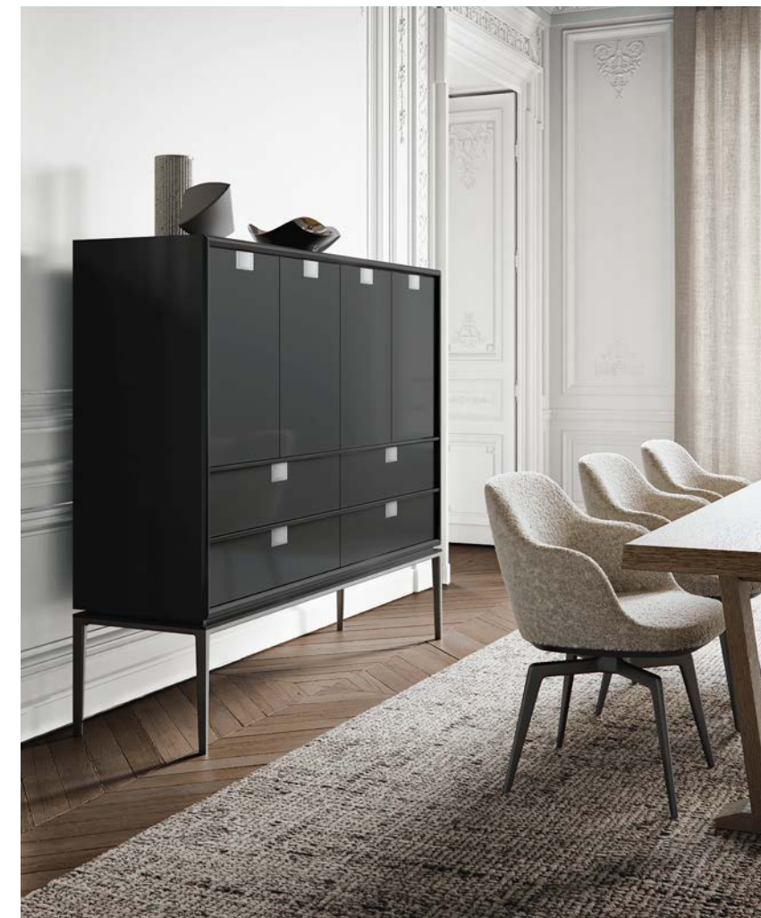
Artemone storage unit, shellac type finish black. Caratos swivel chairs, Milo fabric. Intoto table, brushed light oak. Milos carpet, graphite colour.