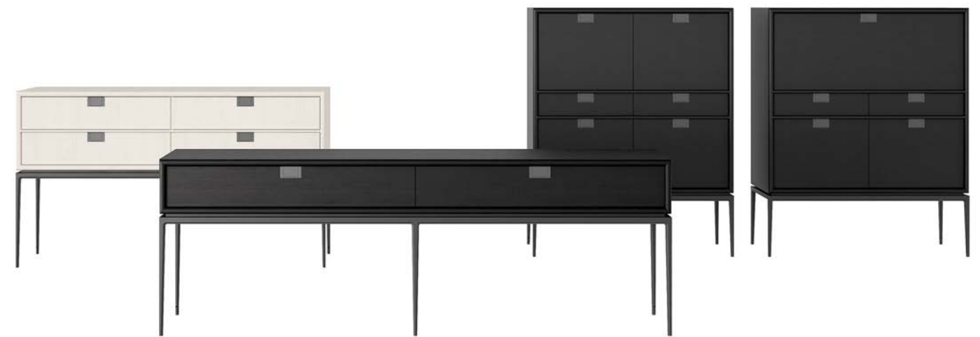
Artemone storage units and console, shellac type finish black and white rough cut oak. Caratos swivel chair, Diana fabric.