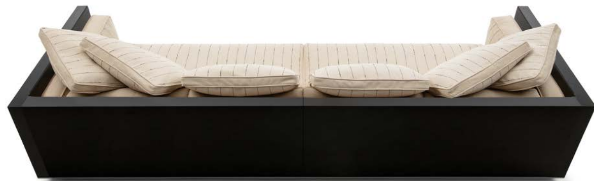
Florius sofa, Doris pinstripe fabric, shellac type finish black. Soleide small table, pewter colour reflective "hammered" steel. Riso carpet, light colour.