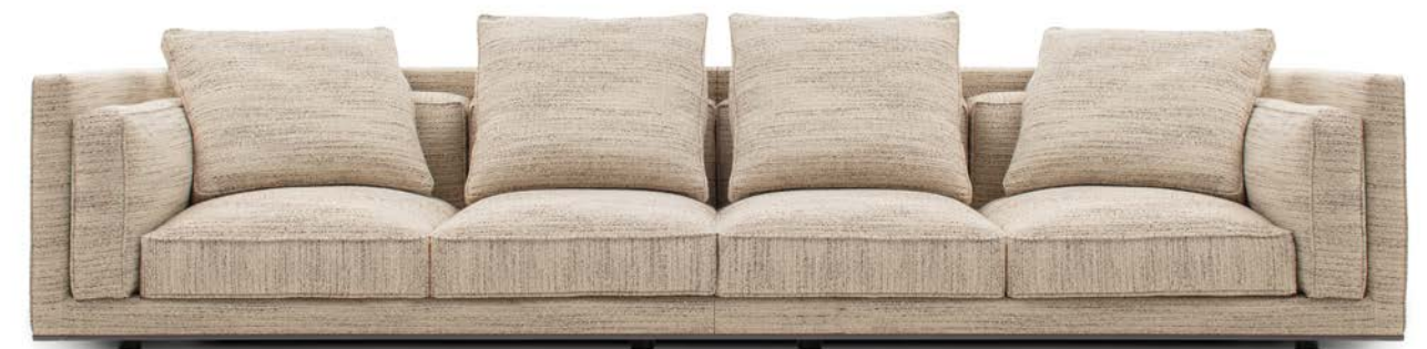
Florius sofa, Diana and Liveri fabrics. Soleide small table, pewter colour reflective "hammered" steel.