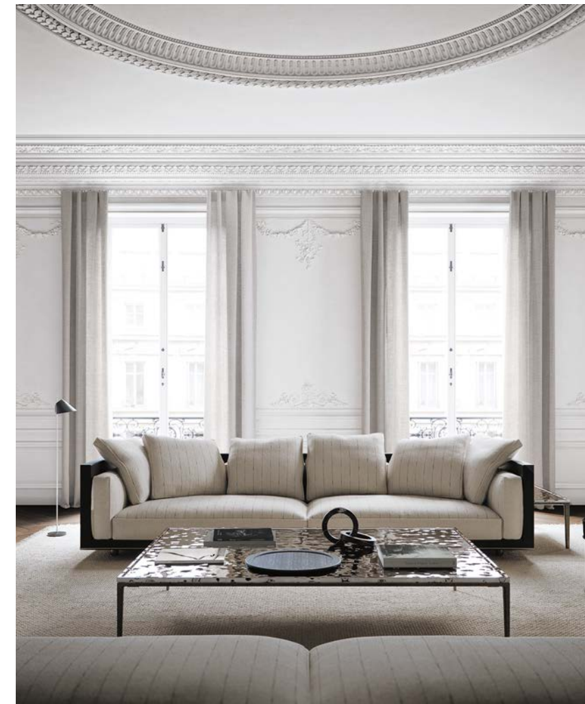
Florius sofa, Doris pinstripe fabric, shellac type finish black. Soleide small table, pewter colour reflective "hammered" steel. Riso carpet, light colour.