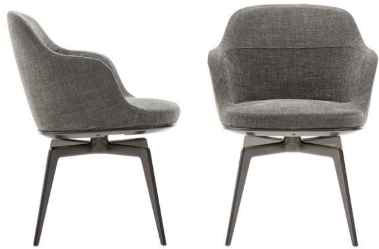
Caratos swivel chairs, Lodi and Milo fabric. Milos carpet, graphite colour.